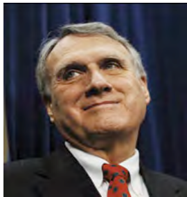
Senator Jon Kyl Republican - Arizona Senate Judiciary Committee