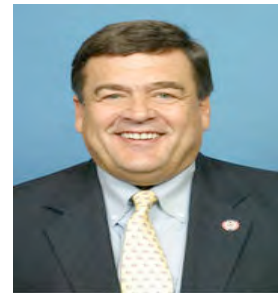
Rep. Dutch Ruppersberger Democrat - Maryland Gov. Reform Committee