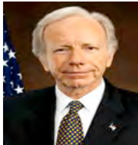
Senator Joseph Lieberman Democrat - Connecticut Homeland Security Committee