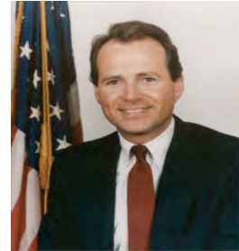
Rep. David Dreier Republican - California House Rules Committee