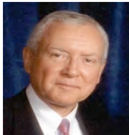
Senator Orrin Hatch Republican - Utah Senate Judiciary Committee