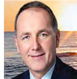
Rep. Peter Hoekstra Republican - Michigan Committee on Intelligence