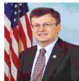
Rep. Mark Souder Republican - Indiana Gov. Reform Committee