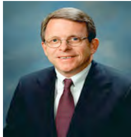
Senator Mike DeWine Republican - Ohio Senate Judiciary Committee