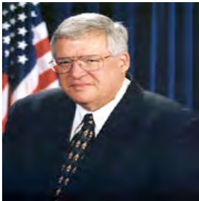
Rep. Dennis Hastert Republican - Illinois Speaker of the House