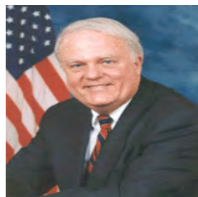
Rep. James Sensenbrenner Republican - Wisconsin House Judiciary Committee